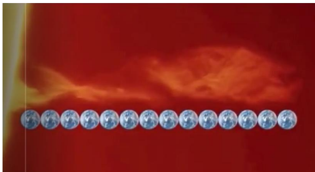
Giant tornado on the Sun. (Cosmic news (2023)) 14 Earth diameters are shown for comparison

Fortunately, no simultaneous nuclear tests have been conducted in the atmosphere, but even single super-powerful thermonuclear explosions can prove fatal. Contemporary science cannot predict this effect, which is inexplicable from the point of view of the accepted idea of empty space. Therefore, it is believed that the height of the nuclear mushroom cannot exceed the Earth's atmosphere. The real physical essence is that the antigravity effect is not an atmospheric phenomenon, but an effect of the etheric medium, i.e. not limited by the atmosphere. This explains why the tornado effect seen on the Sun ejects a huge amount of mass despite the Sun's enormous gravity.